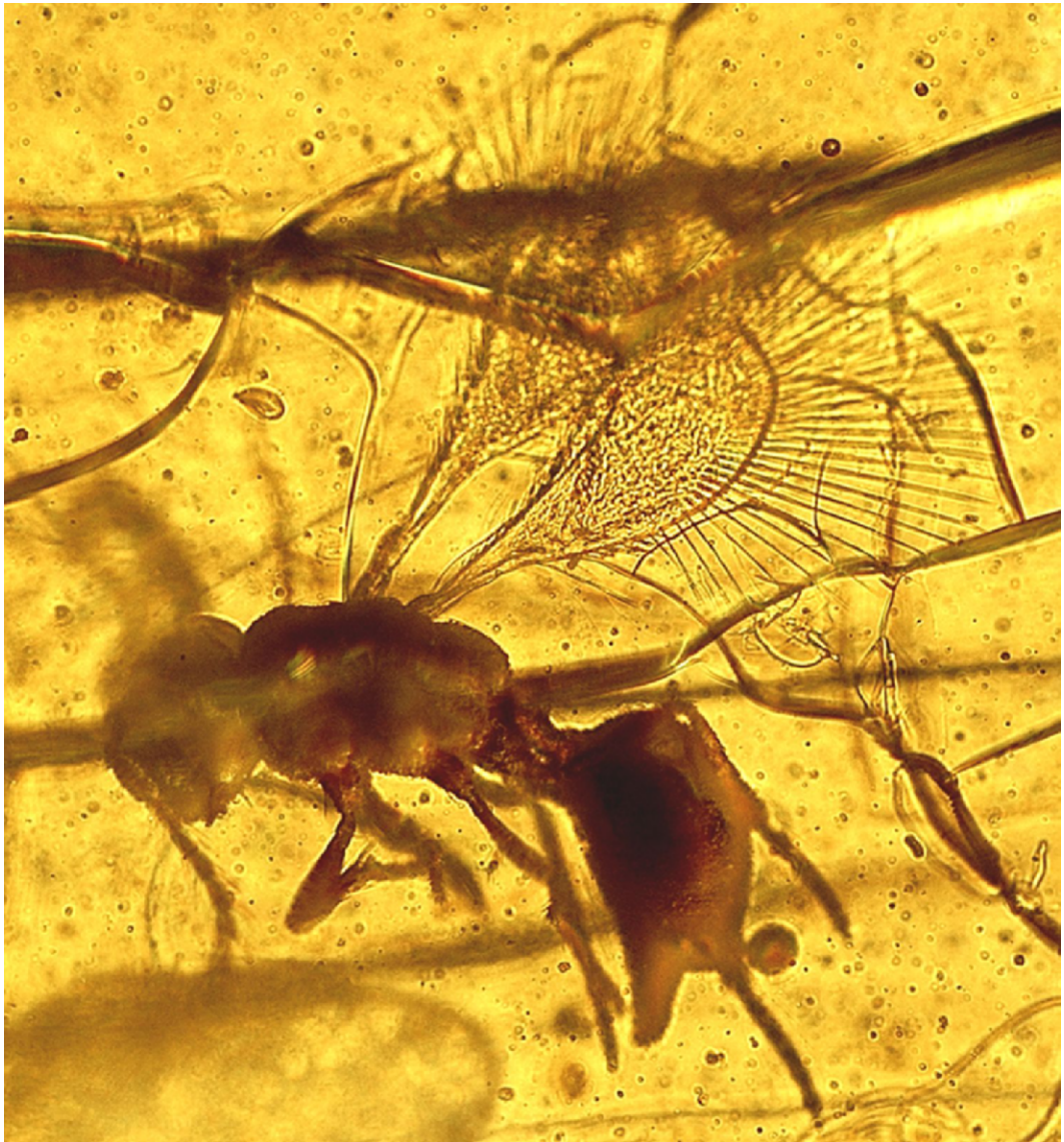
Figure 3. Lateral aspect of paratype male of Archaeromma carnifex Engel and Grimaldi, new species (AMNH NJ-1005), in Late Cretaceous (Turonian) amber from New Jersey (total length of specimen 0.51 mm).

disc membrane with distinct mesh-like rugosity or reticulations (Fig. 2), with a few scattered, short setae; distinct, elongate, suberect, posterobasal marginal seta (Fig. 2) offset by series of seven distinctly short and suberect setae from apical marginal fringe of elongate, erect setae; 55 erect marginal setae present (52 of these distinctly elongate) (Fig. 2).